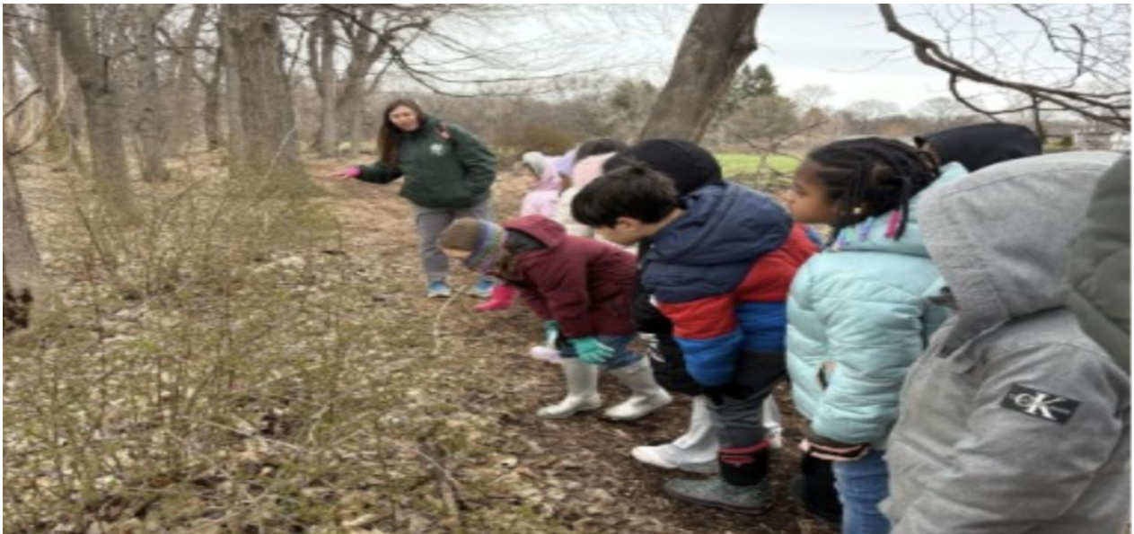
3rd graders at Helmer Nature Center learning about food webs and habitats